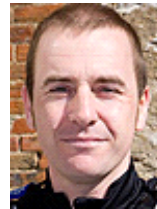
Pcs0 30017 England